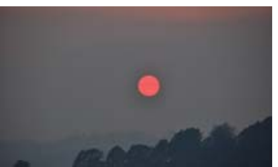
Andy Scheck's third place photo